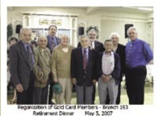
Recognition of Gold Card Members - Branch 193 Retirement Dinner May 5, 2007